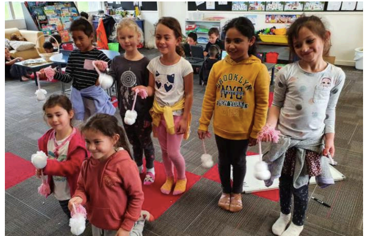
Akomanga 13 kotiro learning poi and waiata