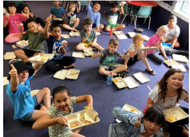
Akomanga 9 with their school lunches

Ka mau te wehi! Our school lunches are AMAZING!! It has been absolutely wonderful to see our tamariki enjoy their beautifully prepared and delicious kai for their lunch. The joy on their faces and their feedback has shown us that within the first two days, the school lunches are a hit. Many thanks to all those whānau who sent back the form identifying allergies and cultural requirements, as this has been successfully implemented by the lunch provider company. Please remember to keep sending your child with a packed morning tea, brainfood and water bottle for the day.