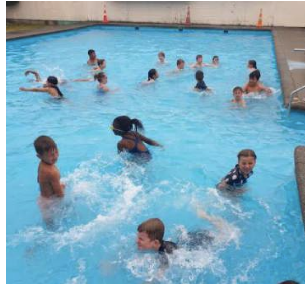
Akomanga 8 enjoying their swimming lessons with Kelly Sports