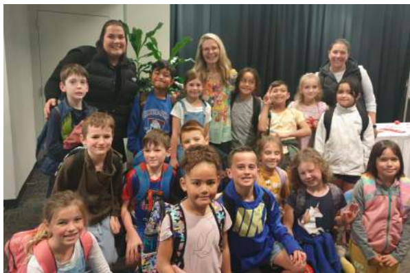
Year 3/4 tamariki at Kind Hearts