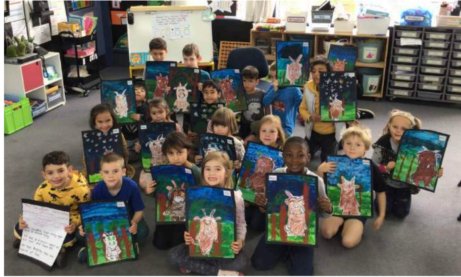
Gruffalo Artwork - Akomanga 22

However - our tamariki can be commended for the amazing learning they have undertaken this term. Recent analysis of our data shows that our tamariki are achieving very well and they can be really proud of all their successes. We also need to be mindful that success does not always mean academic achievement - success can also be: remaining calm in a challenging situation, learning how to share, being able to regulate emotions, carrying their own bag into school, completing a task independently for the first time. Our tamariki have earned a much needed break, ready to recharge for Term 3.