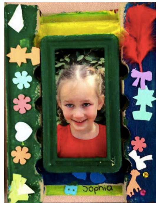
Sophia's beautiful artwork