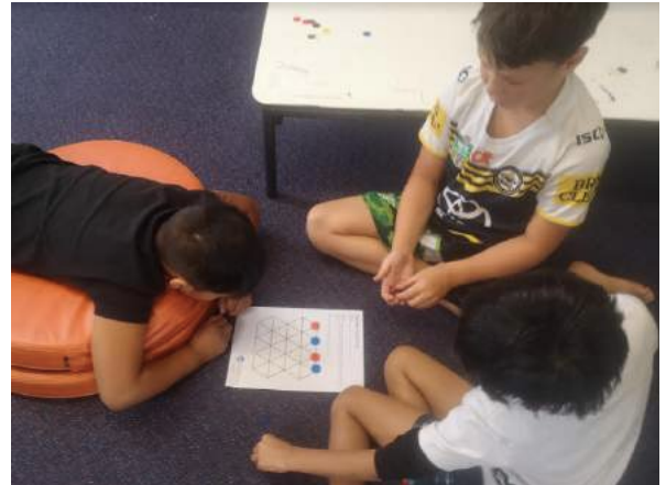
Akomanga 3 practising maths games