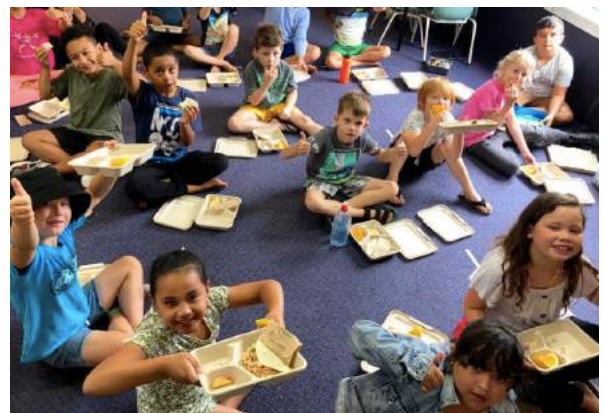
Akomanga 8 enjoying their school lunches