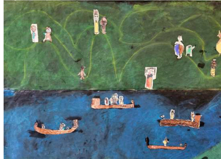
Aotearoa NZ Histories Curriculum learning History of Papaioea - Akomanga 18

The past two weeks has seen many of our staff absent from school, which is reflected nationwide. Across the motu, numerous schools are feeling the pinch of absences with their staff, due to COVID and other winter ailments. With less relievers available, it is becoming more and more challenging to find relievers to cover classes. Where we can, we are using our well known part-time teachers to cover classes, or, we are having to split classes. Please know, we are doing the best we can to maintain learning and teaching for all our tamariki and we really do thank you for your massive support and understanding during this winter period.