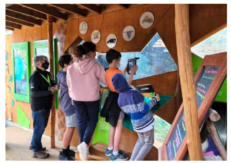
Akomanga 2 at The Wild Base Discovery Centre

While it has been incredibly rough and horrible over the past few days, a massive thanks to all those whānau who parked and/or dropped off their children safely at the entrances of our school. While it may seem like the best idea to