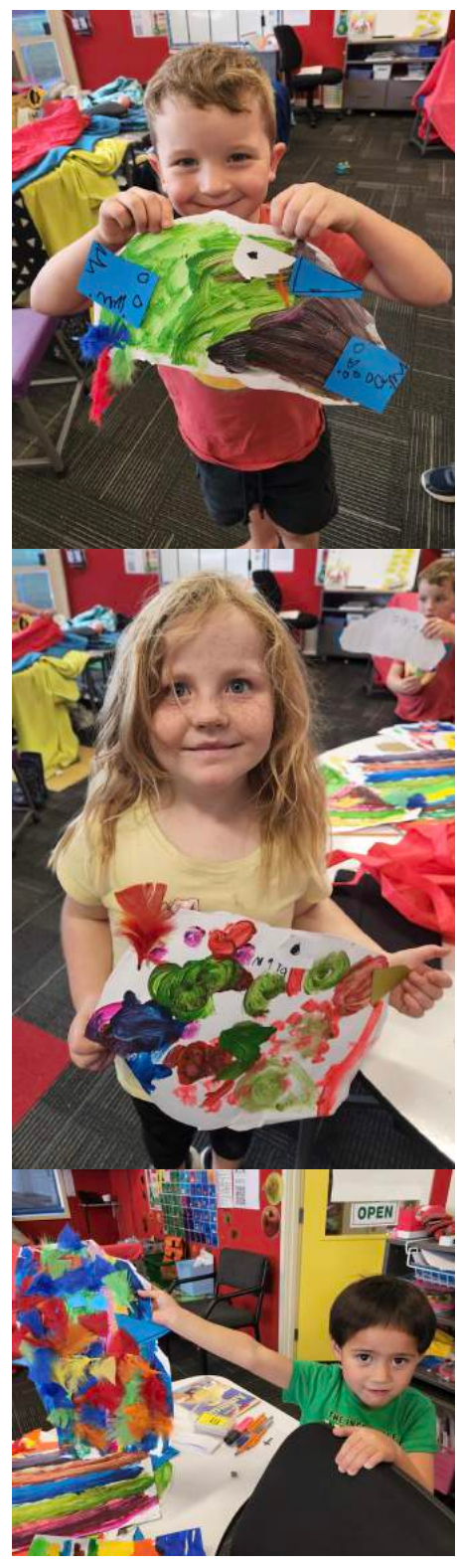
Science - The Living World Akomanga 11 making their own insects