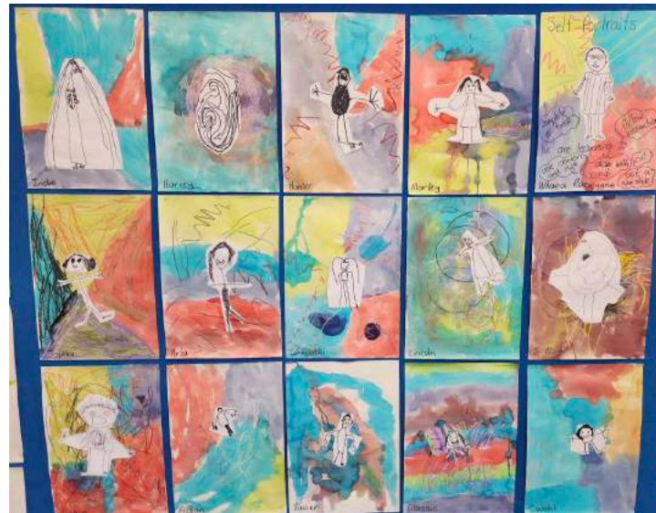
Self Portrait Art - Akomanga 9

We can share a range of information on Seesaw about your child, their learning and achievement. In return, you can view and comment on your child's learning and also message your child's kaiako - an equal balance of support for the child. You can login in to Seesaw with the login details you had last year. If your child is new to our kura, a notice will be sent home with them with how to get the app and login.